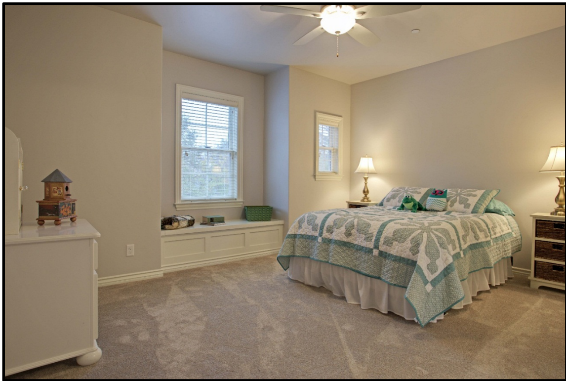
Guest Room and Bath